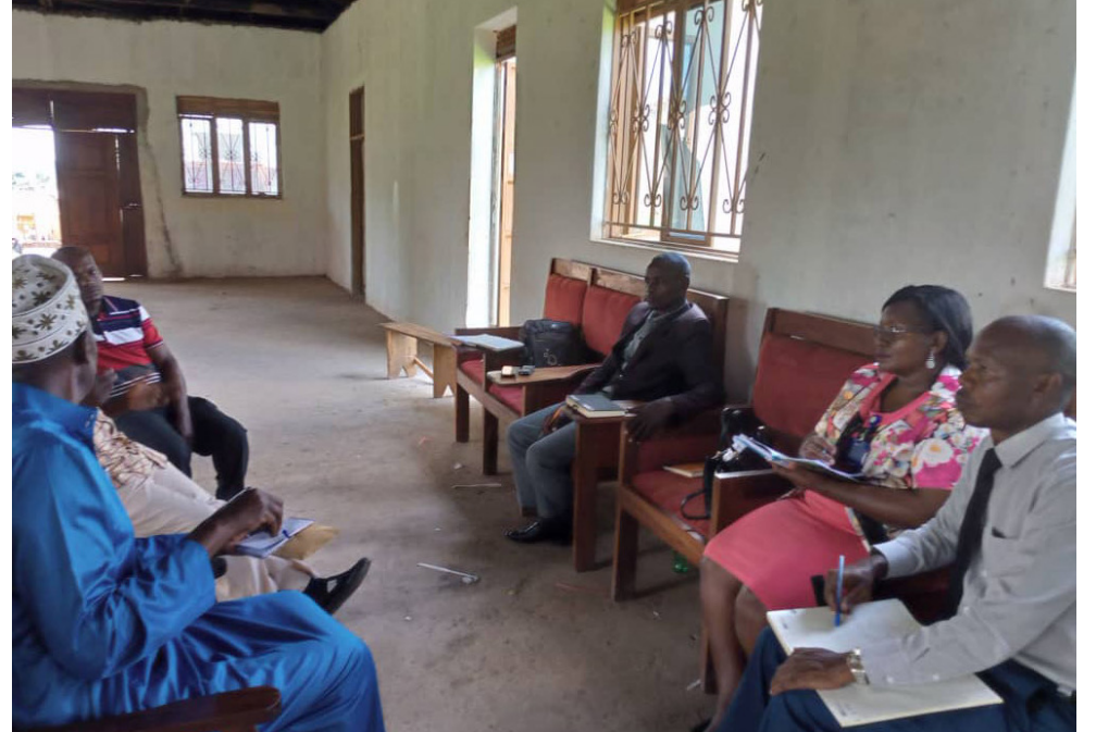
Olikiiko nga lugenda mu maaso