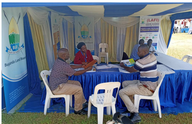
Abamu ku bagenyi abaakyalako ku mudaala bwa BLB