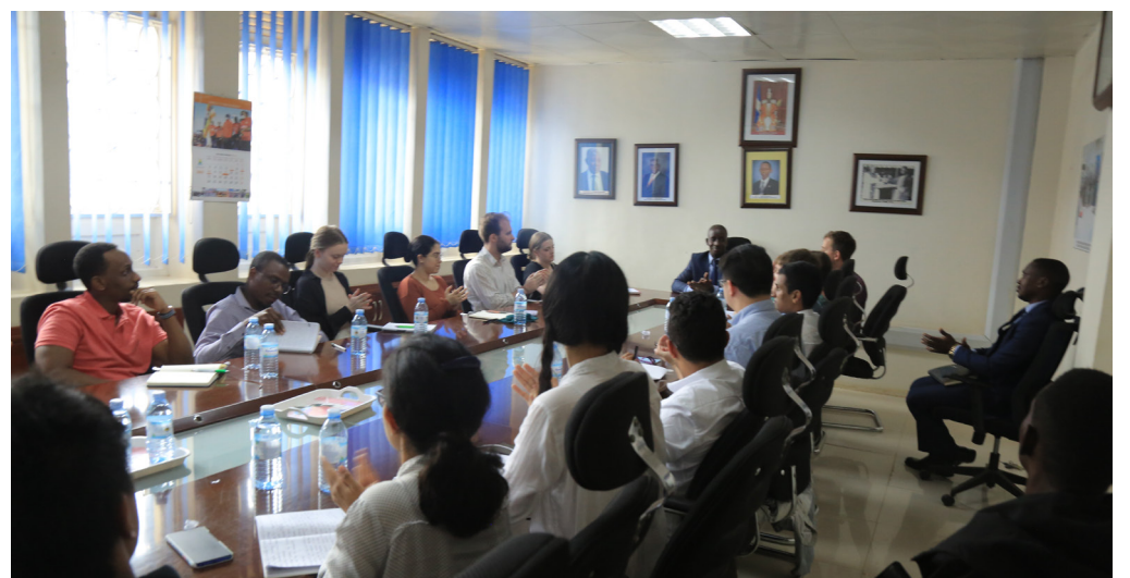
Olukiiko nga lugenda mu maaso

bayambye abantu okwesitula mu mbeera zaabwe okuyita mu nzirukanya y'ettaka mu Buganda ne Uganda yonna okutwalira awamu. Abagenyi era babasomesezza ku mateeka agafuga ettaka mu ggwanga ssaako ebyafaayo by'okuliddukanya mu Buganda. Ensisinkano eno yabadde mu kisenge omutuuzibwa enkiiko ku kizimbe Masengere.