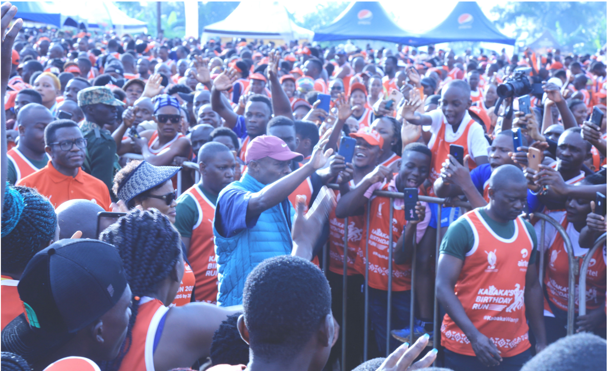
Kabaka ngáwuubira ku nnamungí wómuntu eyeetaba mu misinde gyámazaalibwa