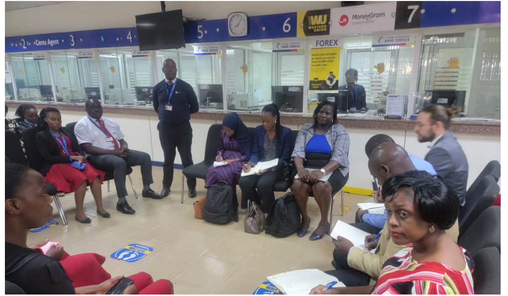
Ensisinkano ne Centenary Bank

Bannamukago bannaffe ab'ekitongole ki GIZ, ekimu ku bitongole ebikola ku nsonga z'okutereeza obusenze bw'abantu naddala abo abawejjere n'abateesobola bakyaddeko mu ofisi zaffe okulaba BLB bw'etambuza emirimu gy'okuddukanya n'okulabirira ettaka.