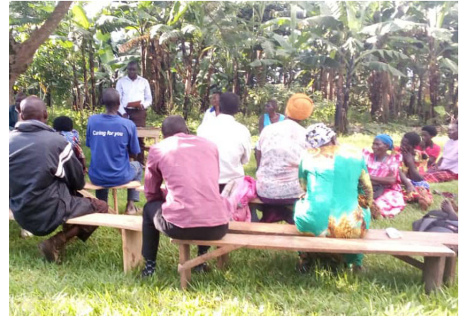
Omusomo ku nsonga z'ettaka