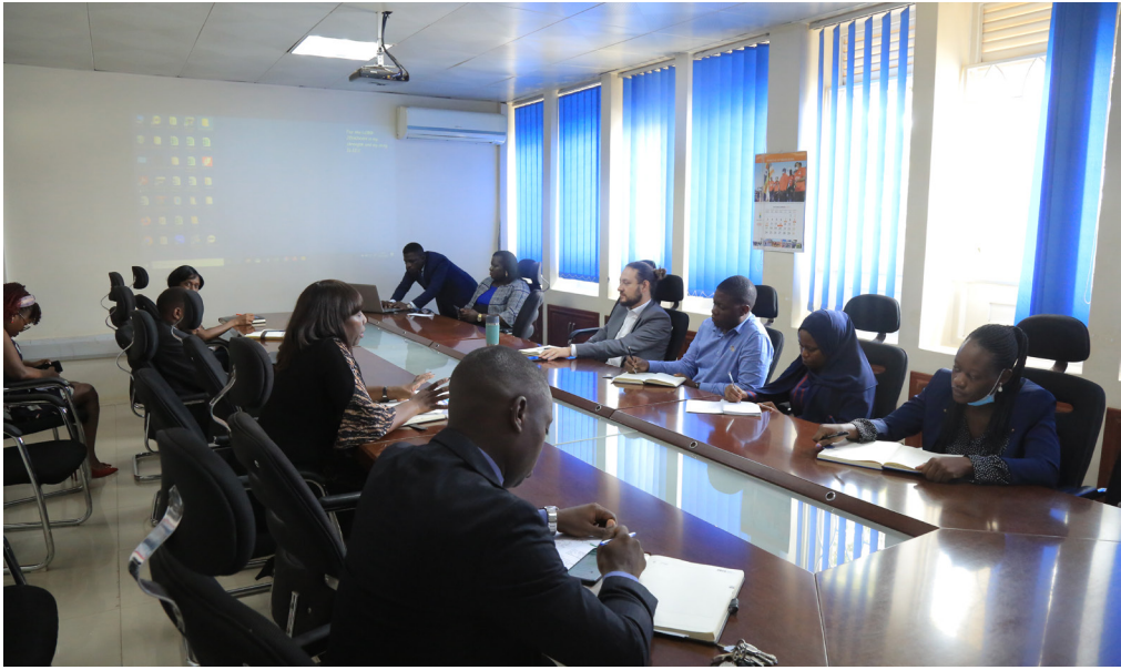
Olukiiko nga lugenda mu masso