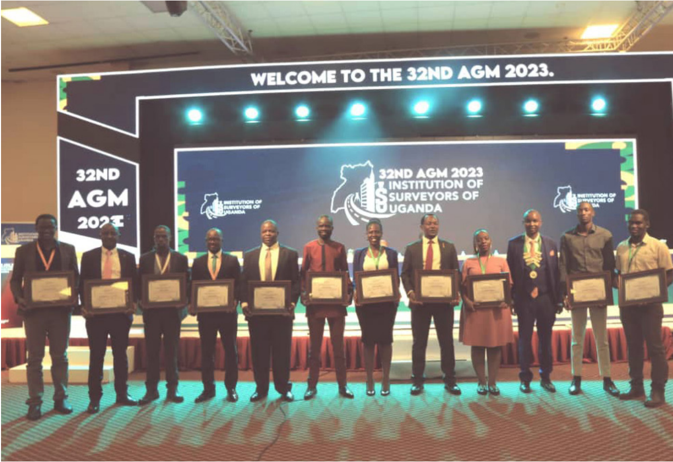
Ekifaananyi ekyawamu ekyolukiiko olufuzi