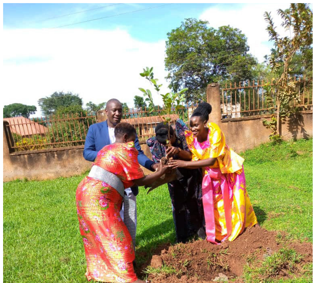
Abakozi be Buddu nga basimba omuti