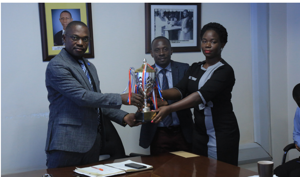
Abatwala Kibuga nga bakwasibwa ekikopo

Bannantawunyikamu mu by'okuwenja obusimooni omwaka guno bukya gwezingulula, ab'ettabi lya Kibuga neera bakyatisse, nga kirabika kyagala kufuuka kya bulijjo ettabi okutwala ekikopo buli mwezi. Kino baawangula kya Mugulansigo bwe baalaga amatabi amalala amaanyi era ng'ensangi zino