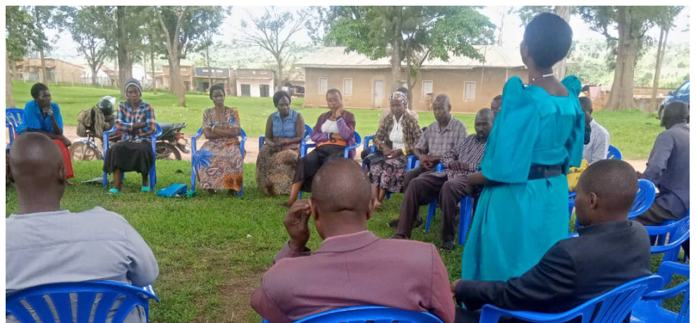
Omusomo e Lwengo