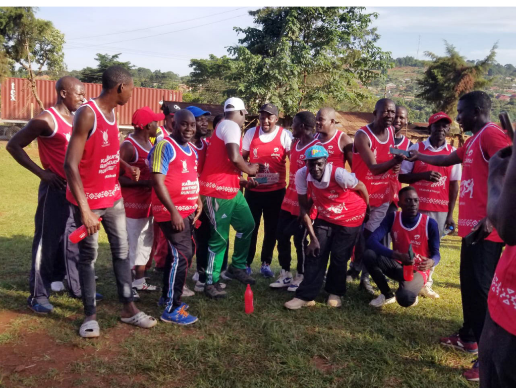
Abakozi ba BLBabaasinziira e Kyaggwe