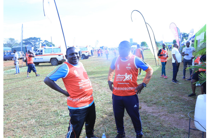
Abakozi ba BLB abalala

Ttiimu ya BLB yabukeerezza nkokola okwetaba mu misinde gy'amazaalibwa ga Beene egyasimbuddwa mu lubiri e Mengo, Ssaabasajja bwe yawuubye bendera okusimbula abaddusi mu miteeko egyenjwulo. Ku mulundi guno emisinde gy'amazaalibwa gyaluubiridde okulwanirira ensonga y'obutasaasanya kawuka akaleeta mukenenya, okulaba nga kafufuggazibwa omwaka 2030 we gunaatuukira.