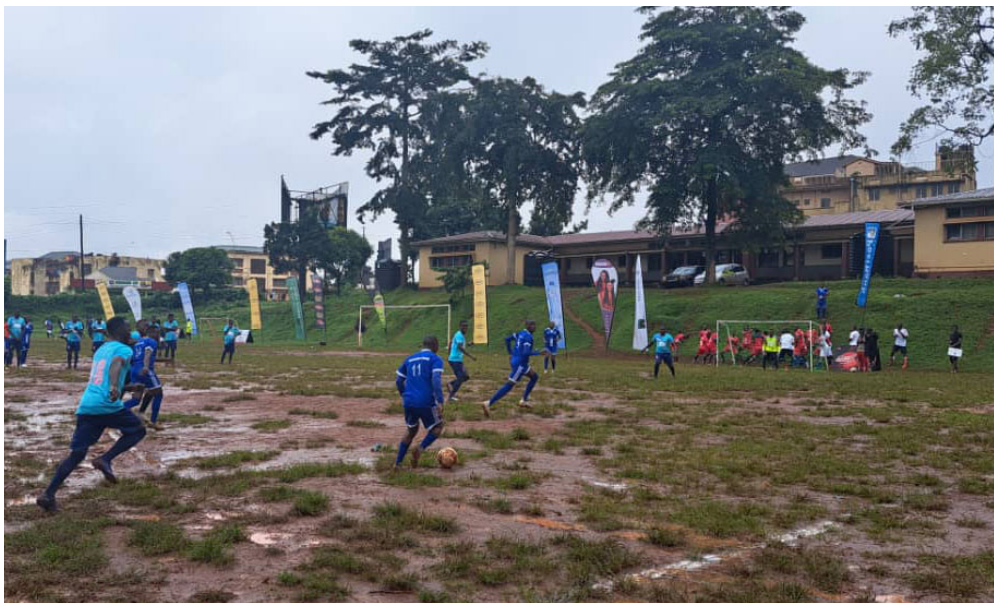
Omupiira nga gugenda mu maaso wakati mu nkuba

BLB ne ku mulundi guno terina gw'ettidde ku liiso mu mpaka za corporate league newankubadde namutikkwa w'enkuba yasoose kwefuga kisaawe. Emipiira gyaliddwako olwembeera y'obudde, olwo buli ttiimu n'ezannya emizannyo ebiri. BLB gyombi yagiwuuse buva bwe yawuttudde Balore Logistics 2-0 ate UCAA yakubiddwa ekkene.