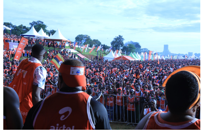
Namungi w'omuntu eyeetaba mu misinde