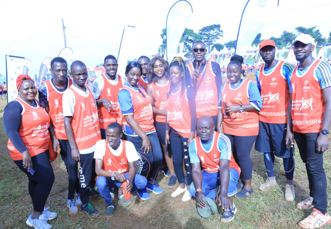
Abakozi ba BLB abalala