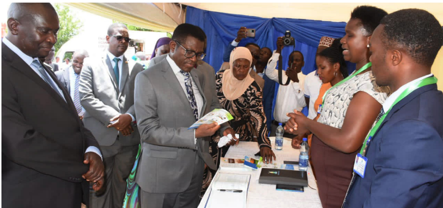
Katikkiro ku mudaala gwa BLB