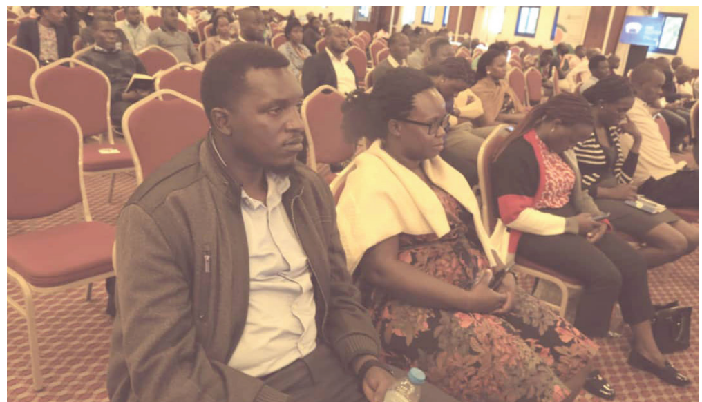
Abamu ku bapunta abawereza mu BLB nga beetabye mu lukung'aana ttabamiruka (AGM) olubagatta wansi w'ekibiina kya Institution of Surveyors of Uganda (ISU)..Lutuula buli mwaka okukuba ttooki mu bituukiddwako n'okusoomooza okukosa abapunta mu ggwanga