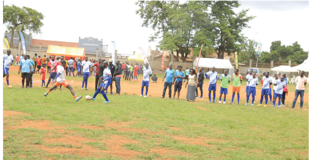
BLB mu nsiike ne SGA