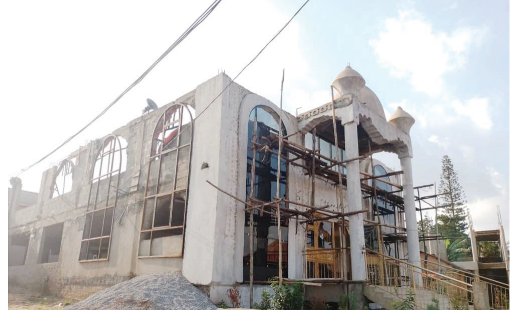
Omuzikiti nga bwe gufaanana

BLB ewaddeyo ensawo za sseminti eziweredde ddala 77 eri Obusiraamu mu Nansana mu kawefube eyakoledwa okuwagira okumaliriza omuzikiti mu kitundu kino.