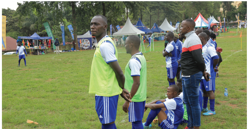
Abatendesi n'abazannyi abalala nga bagwota buliro