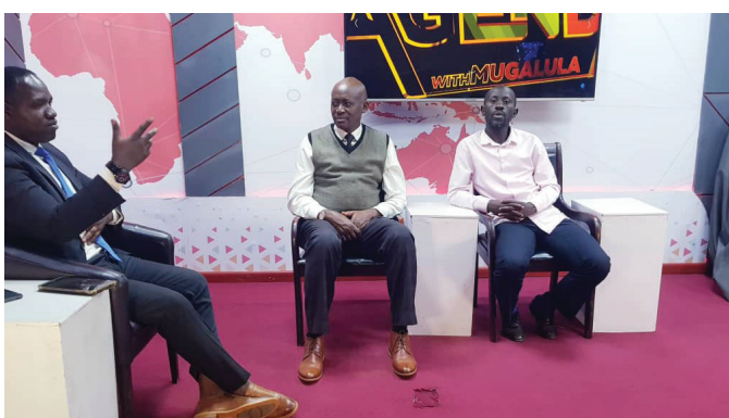
Omusomesa Gambobbi ku Dream TV ng'ayirimu enjiri y'ettaka