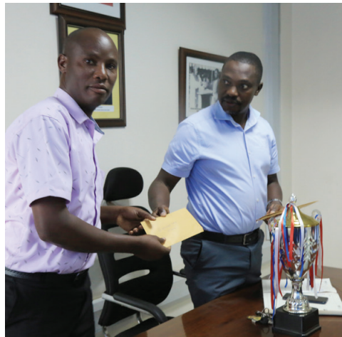
Abamu ku bakozi abaasukkuluma ku bannaabwe nga bakwasibwa ebbaasa

Ettabi lya Kibuga lyaddirirwa erye Mityana, Kyaggwe, Buddu, Luweero, Nansana, Ndejje, Njeru