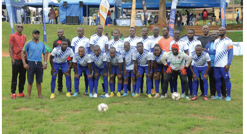
Ttiimu y'omupiira nga yeetegeka okugusamba

BLB yeerisizza nkuuli mu mizannyo gy'ebitongole ebinene ku mitendere egyenjawulo, bwe yakubye buli ttiimu eyagiweereddwa mu mupiira ogwebigere okwabaddde Van Zanteen gye yakubye 2-1, SGA yakubiddwa ekkene ate aba Exclusive Cutting ne babwatulwa 2 nga tebaanukudde. Mu gw'abasukka emyaka 35, BLB ne Stanbic tekuli yayise na bateebi so ng'essungu lya Stanbic baalimadde ku Post Bank gye baawumizza 3 -1 ate Jubilee Insurance yakikakasizza BLB bwe yagiwuzze ggoolo 2 nga teyanukudde. Ssenkulu Kabogoza yasiimye abazannyi, abatendesi n'abawagizi ba ttiimu BLB n'abasaba okukuumira ekitongole ku ntikko.