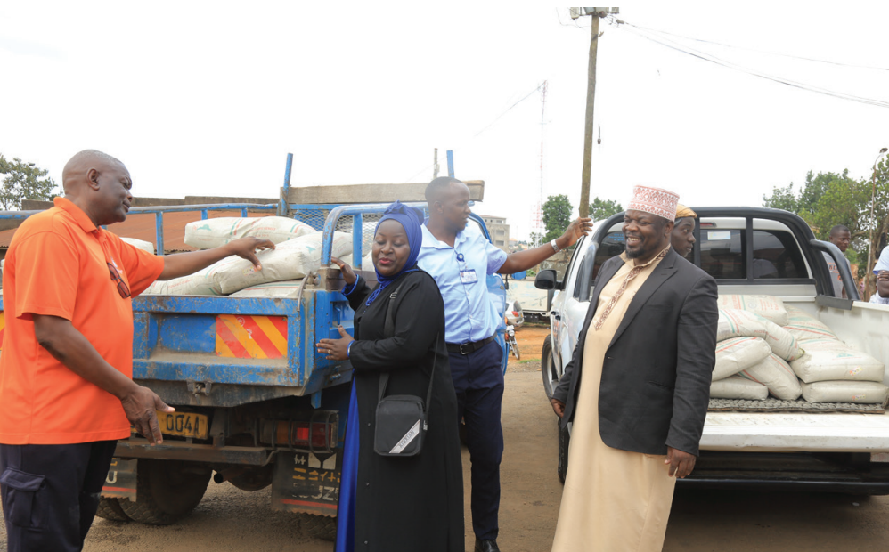
Abasiraamu b'e Nansana nga baaniriza seminti eyatoneddwa BLB