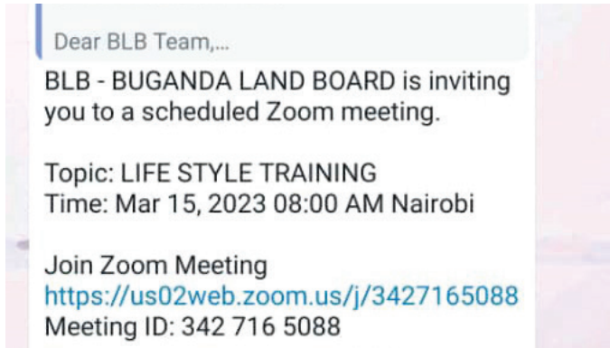
Mu ngeri yeemu, ekiwayi ekivunaanyizibwa ku bakozi kyategeka omusomo gw'abakozi okubabangula ku nneeyisa y'ebiyobulamuu