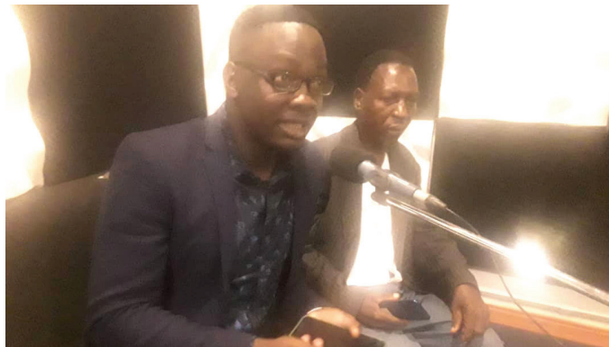
Abamu ku basenze ababeera ku ttaka lya Kabaka e Nakifuma nga baliko gwe bagamba ayagala okubagoba ku ttaka nti alina ekyapa kya freehold ku byalo bisatu. Beekubira enduulu