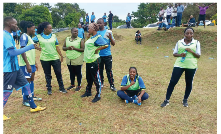
Ttiimu Kibuga eyawangudde nga beegeyaamu