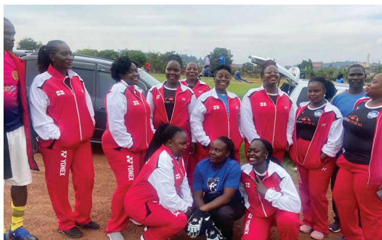
Ttiimu y'e Ndejje ng'enekedde mu mujoozi gwayo

Waabaddewo akabbinkano ku kisaawe mu lubiri e Mengo, ttiimu z'abakyala okuva mu matabi okwabaddde Kibuga ne Ndejje bwe zabinkanye mu kusamba ogwebigere. Bano bwabeefuse era okukkakkana nga Kibuga ewuttudde Ndejje ggoolo 3 nga bo tebaanukudde. Abawangule baasubizza okuddira ttiimu Kibuga bagifufuggaze kubanga luno baasanze tebeetegese kimala ne babakwata vagalanda ssaako obutabeera bamativu na bazannyi be baateeberezza okubeera abacuba. Baaweze okubanoonyerezaako.