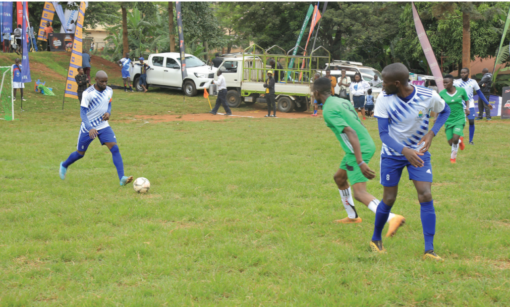
Ntege ng'akulukusa endiba