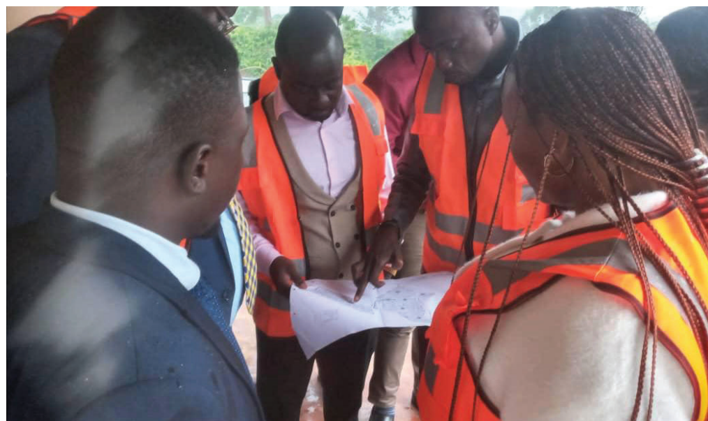
Ttiimu nga yeekebejja pulaani y'eddwaliro ly'e Mukungwe