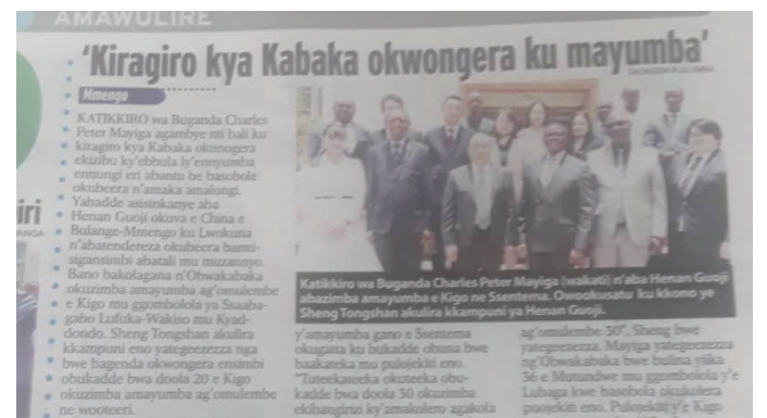
Ne mu Bukedde twafulumiramu